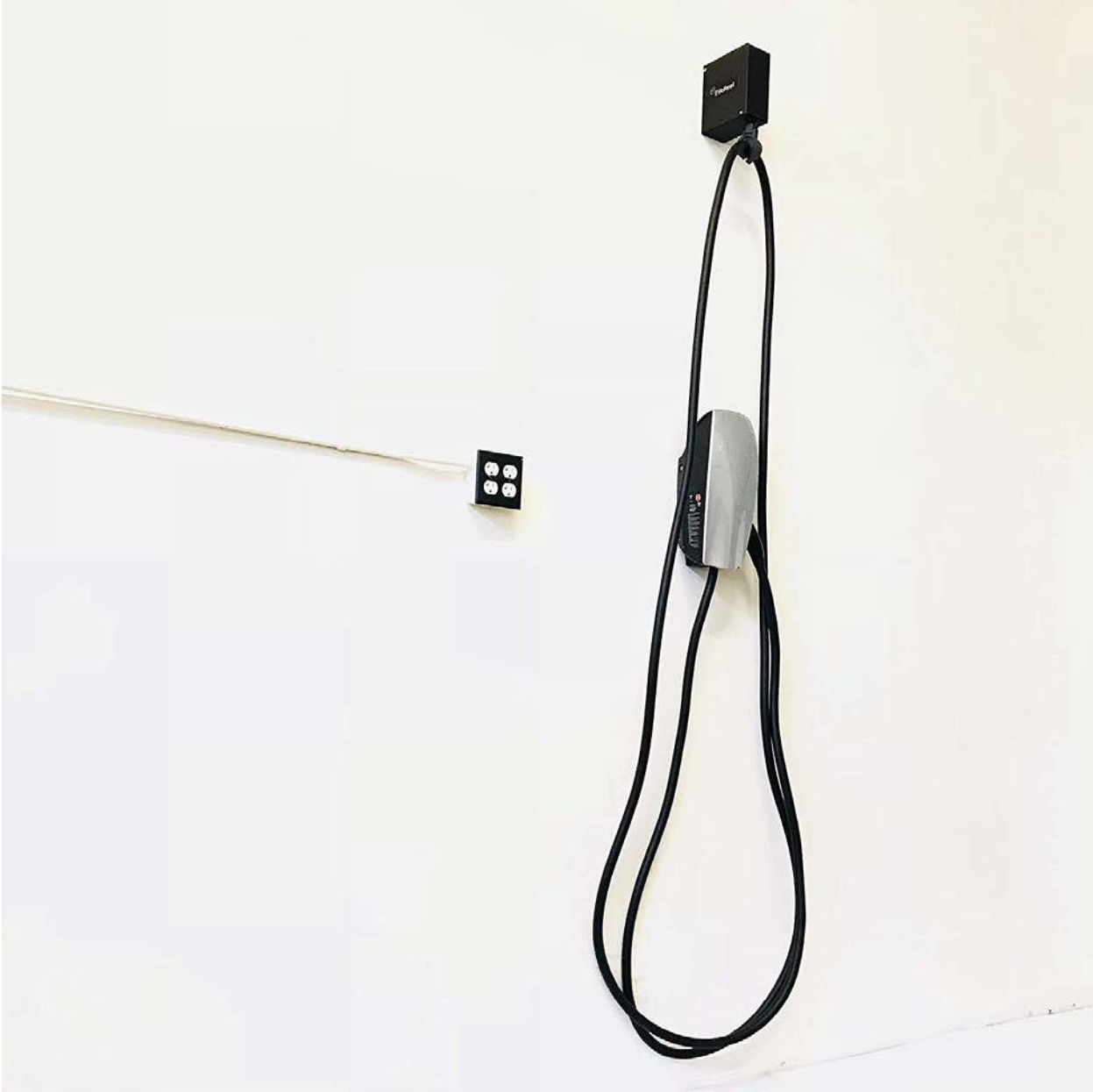
Figure 2-4 Example of installed product