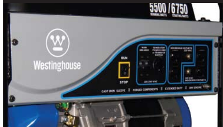
Clean and simple to use control panel.