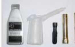
Oil & Tools Included

Producing 1800 running watts of power and weighing only 43 lbs., this 4 cycle, gasoline powered unit will run 13 hours at 50% load. This unit provides two, 120V, AC outlets and contains all you need to get started right out of the box - including the oil . The WH2000iXLT is very quiet making it the perfect companion for all your recreational needs.