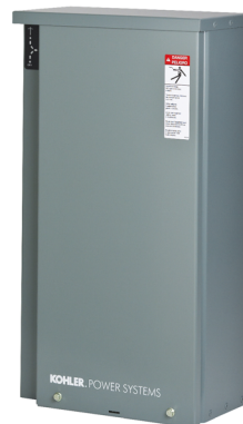
200 Amp with optional status indicator shown.