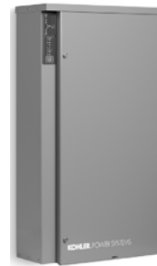
200 Amp with optional status indicator shown.